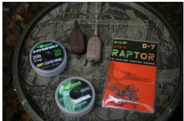
Atomic Inline Bottle Leads, ESP D7 Hooks and Korda's Hybrid Soft and Supernatural Braid for hooklength's

Being a Sunday the lake was now empty and with the Car Park Lake to my self my mind started to wander again! With the swim finally quiet I decided to tidy everything up and seeing as it was forecast to remain dry throughout the night decided against putting up my shelter.