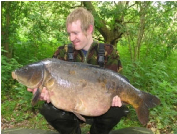
A spring on the Big Pit was just the break I needed! The Double Stomach at 37lb. First time out with the new bait!