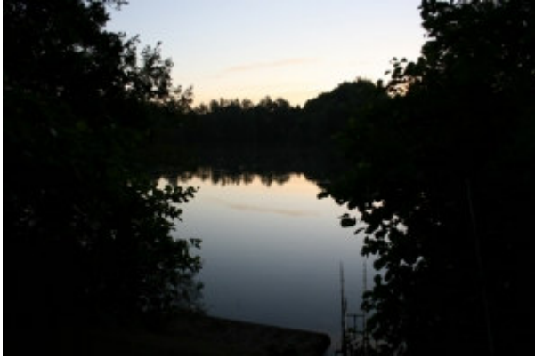
Des's Swim the night before I caught Heather

Although Big O was looking a little worse for wear Hemp Boy was understandably over the moon with his first Car Park mirror and after the shout the usual crowd of members gathered behind the swim for the photo session that followed.